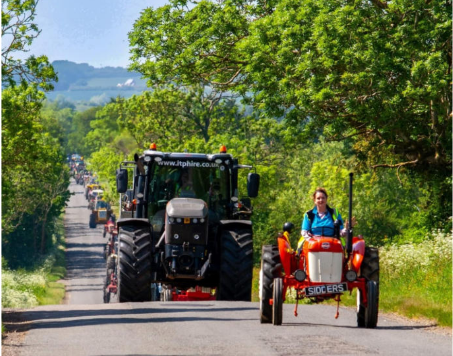
Photograph of the tractor cavalcade taken by Sarah Dillon.

In this issue of the Record you can expect to read: