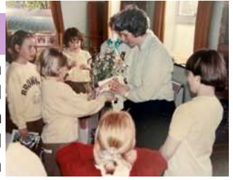
Tysoe Brownies, 1993